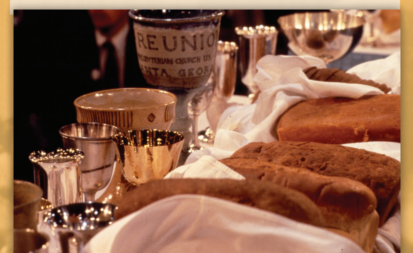
Some of the bread and chalices brought by every presbytery for the communion service.