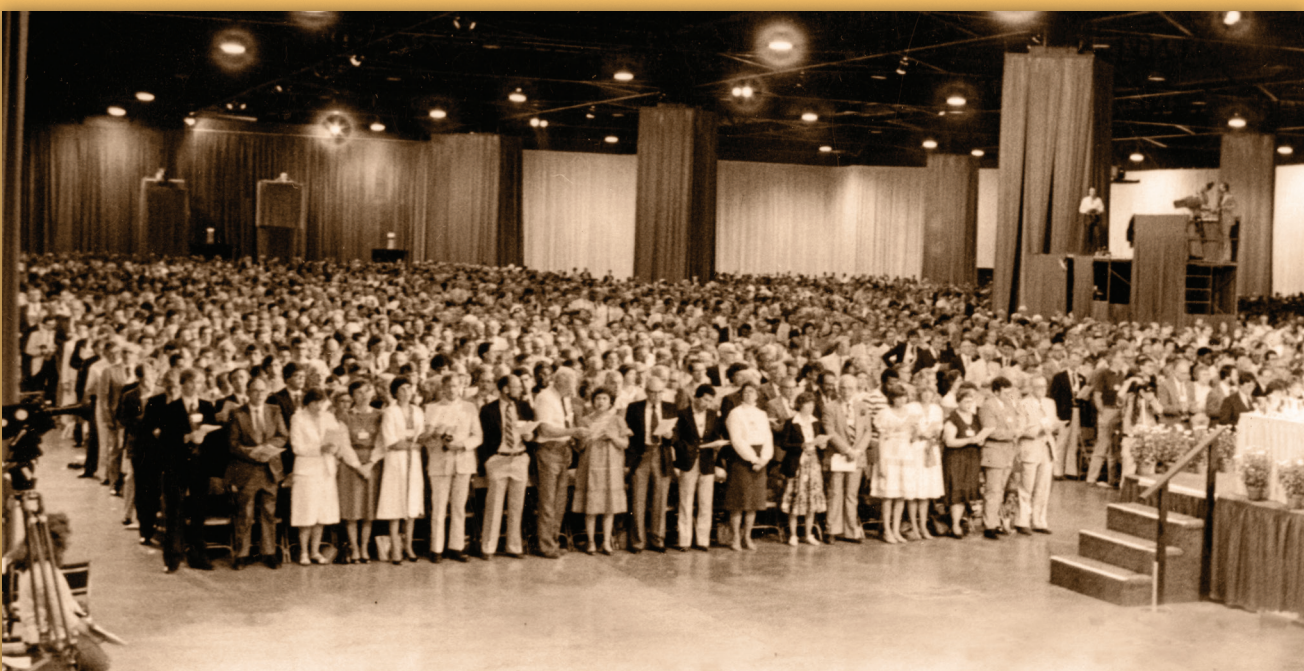
Worshippers at the communion service.

Over 14,000 Presbyterians gathered at the World Congress Center in Atlanta the evening of June 10, 1983, to hear the Declaration of Reunion and celebrate communion. The service opened with a 30-minute processional of commissioners and representatives from each presbytery, carrying banners and bringing communion chalices and bread for the service. Other groups of Presbyterians around the country gathered in their local congregations to take communion and celebrate reunion.