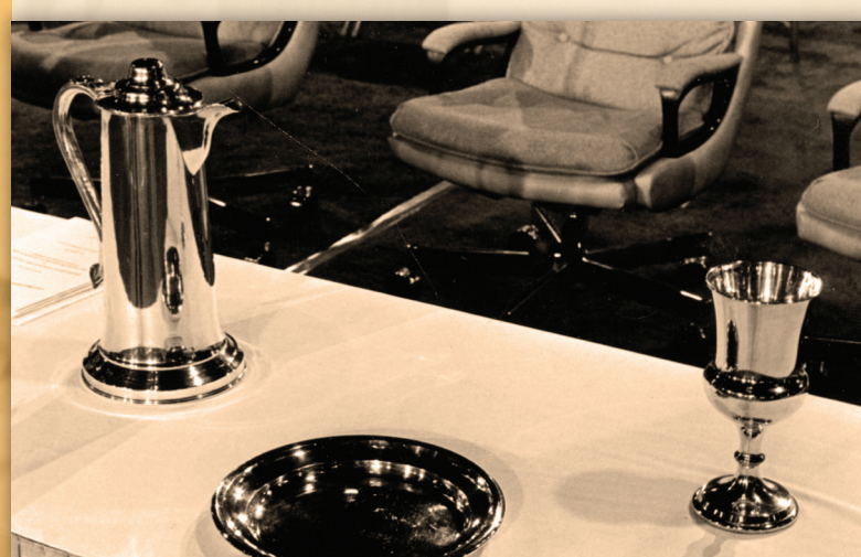
The 200-year-old communion set used by the moderators, from the Upper Octorara Presbyterian Church, Parkesburg, PA.