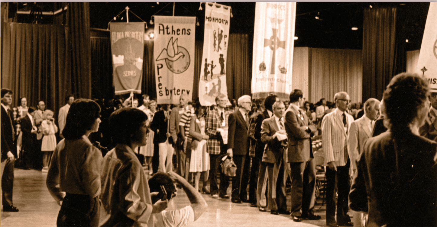
Presbytery banners in processional that preceded the communion service.