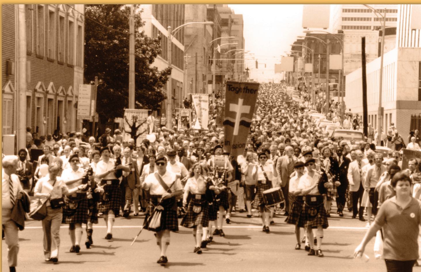
Bagpipers lead the Reunion parade through the streets of Atlanta, June 10, 1983.

After the PCUS and UPCUSA General Assemblies passed the formal resolutions approving reunion on the afternoon of Friday, June 10, 1983, Presbyterians poured into the streets of Atlanta to celebrate the historic event. Carrying banners, singing, and joining hands, they marched the mile from the World Congress Center to City Hall where Mayor Andrew Young greeted the crowd.