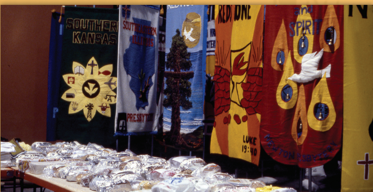
Presbytery banners and bread made by people from every presbytery await the communion service.