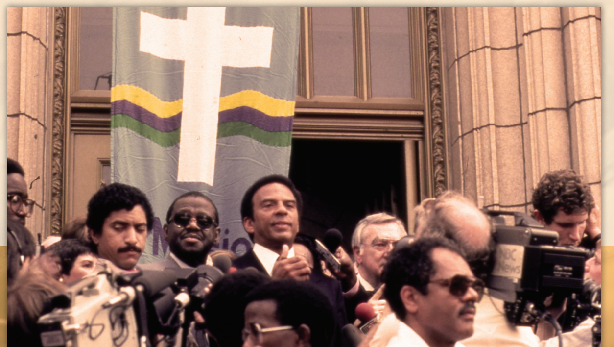
Right: Atlanta Mayor Andrew Young addresses the crowd at City Hall.